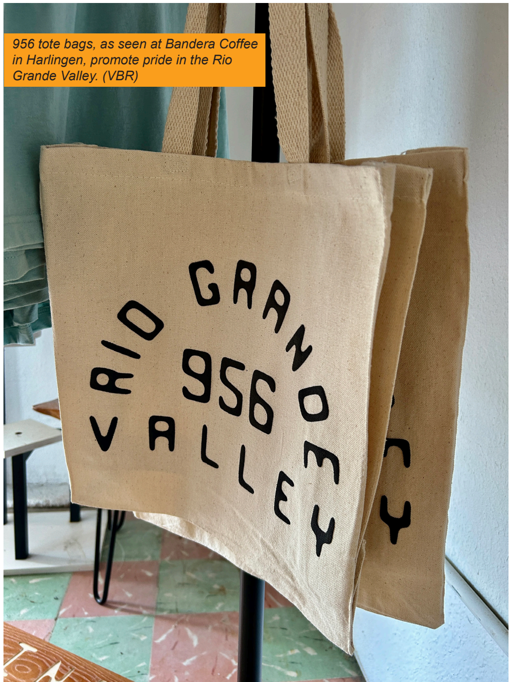
956 tote bags, as seen at Bandera Coffee in Harlingen, promote pride in the Rio Grande Valley. (VBR)