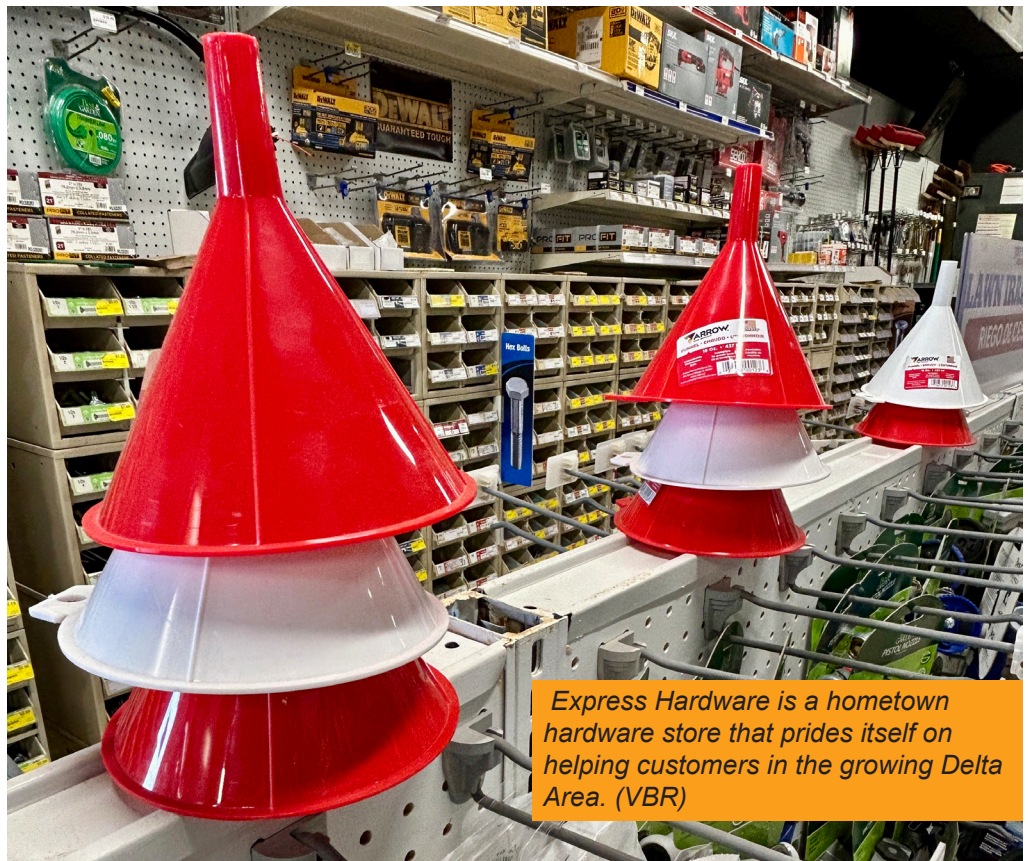
Express Hardware is a hometown hardware store that prides itself on helping customers in the growing Delta Area.

“This is my retirement right here,” he said in his office that was once a small bank vault. “I love coming here every day and working with customers and learning from them because sometimes you’re the student and taking advice from them.”