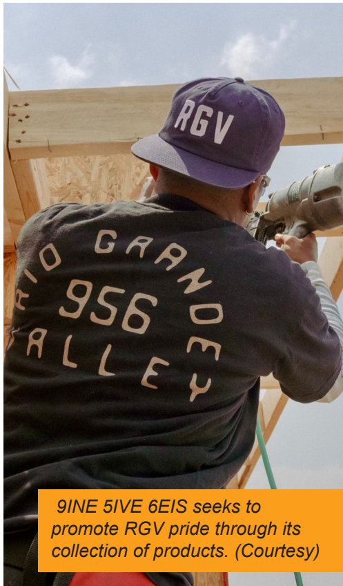
9INE 5IVE 6EIS seeks to promote RGV pride through its collection of products.

For a look at the company’s collection, go to 9INE5IVE6EIS.com, with more images by the same name on Instagram.