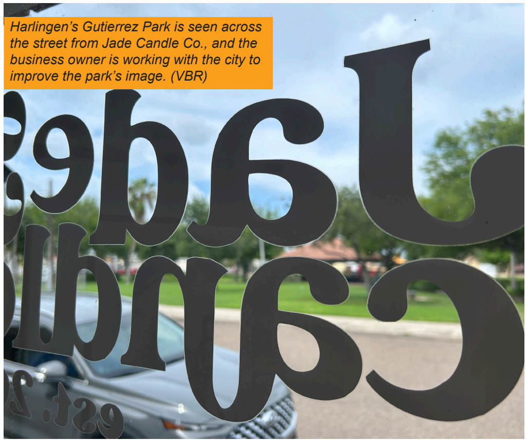
Harlingen's Gutierrez Park is seen across the street from Jade Candle Co., and the business owner is working with the city to improve the park's image.