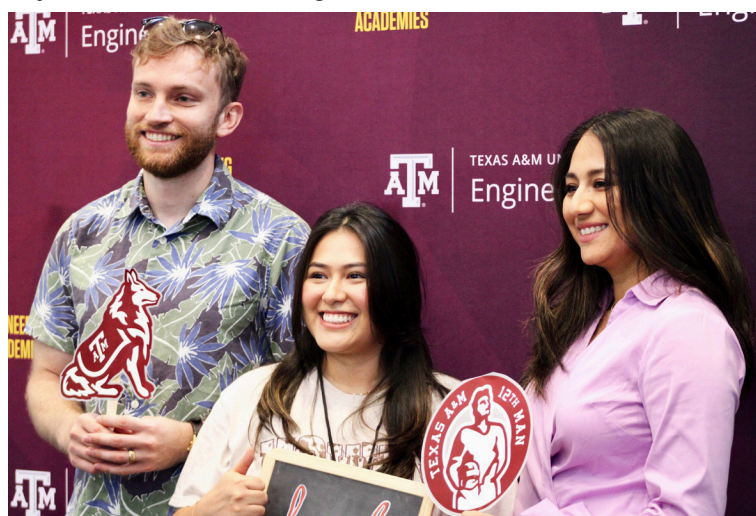
The engineering academy partnership between Texas A&M and South Texas College makes students Aggies from day one of enrollment.

"That's what their time in the Academy is all about, learning what majors are available and seeing what is the best fit for them," she said.