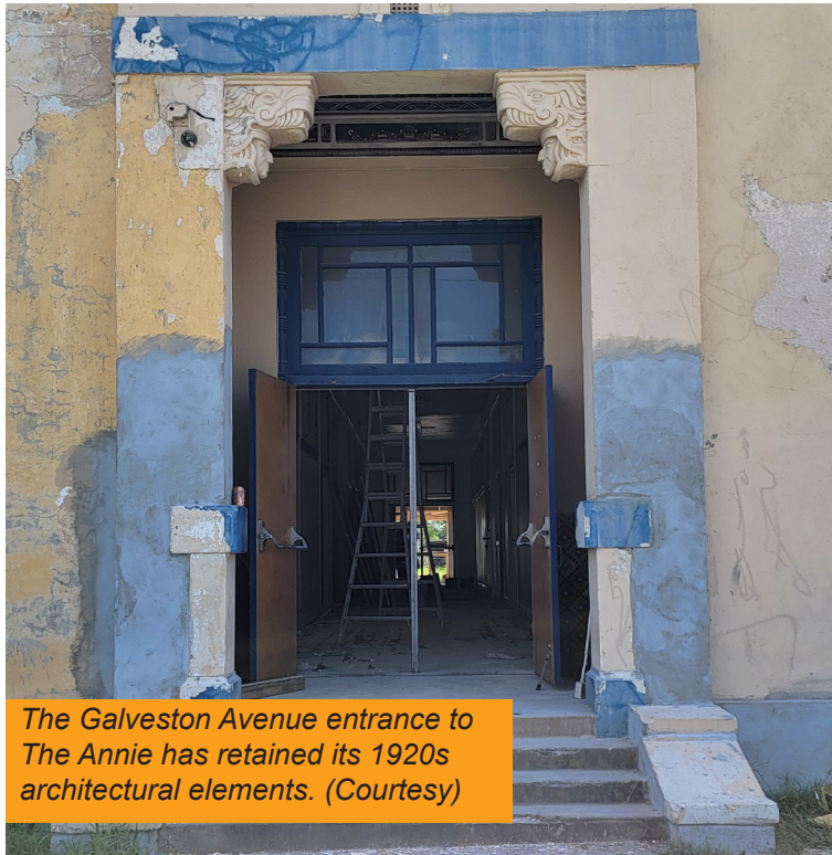
The Galveston Avenue entrance to The Annie has retained its 1920s architectural elements.