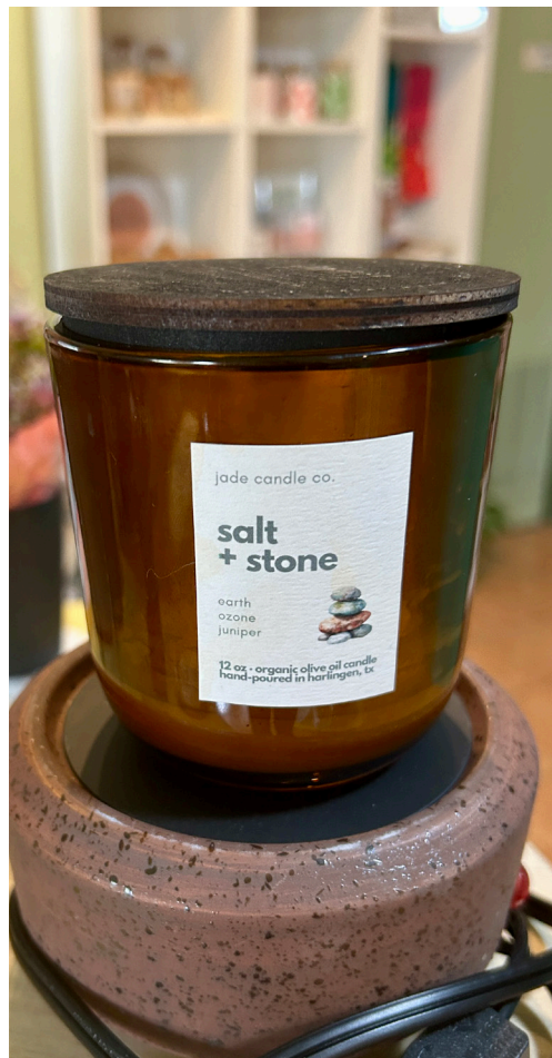
Small heat plates and blocks of wax are popular items with teachers seeking to calm classrooms and fill up learning spaces with pleasant scents. (VBR)

Jade Candle Co. is located at 602 W. Harrison Avenue, Suite B, in Harlingen, with more information available at 956-990-5655.