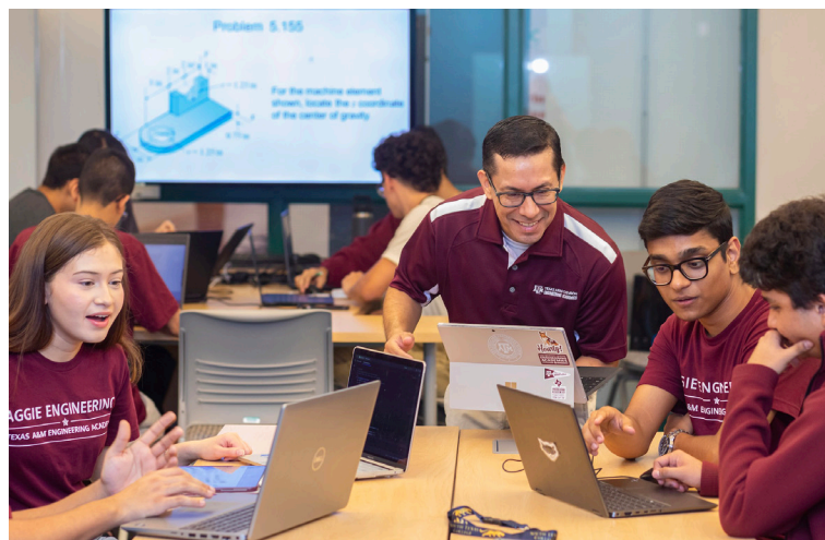
Students enrolled in Texas A&M's Engineering Academy become Aggies while attending classes at South Texas College in McAllen.