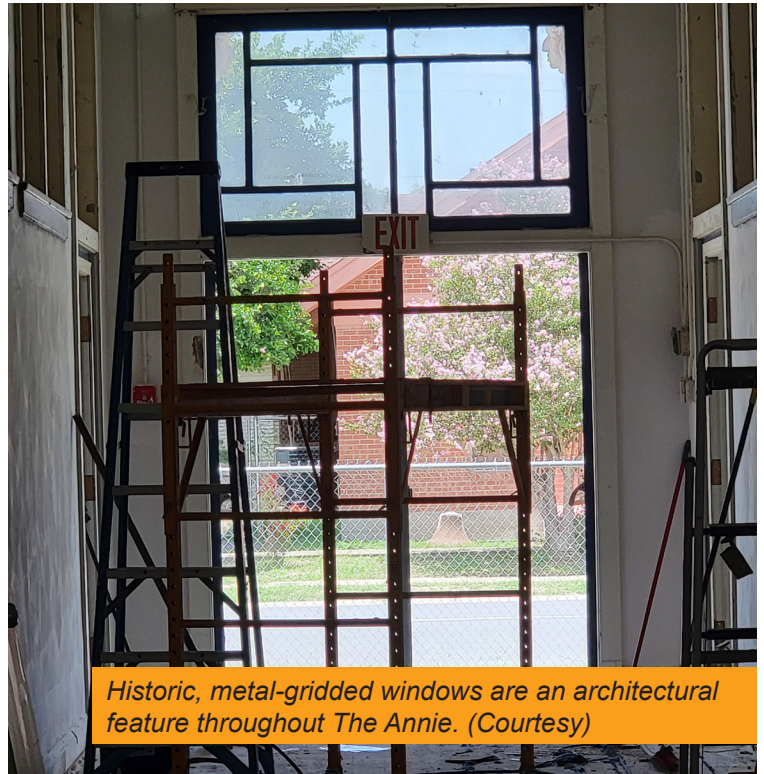
Historic, metal-gridded windows are an architectural feature throughout The Annie.