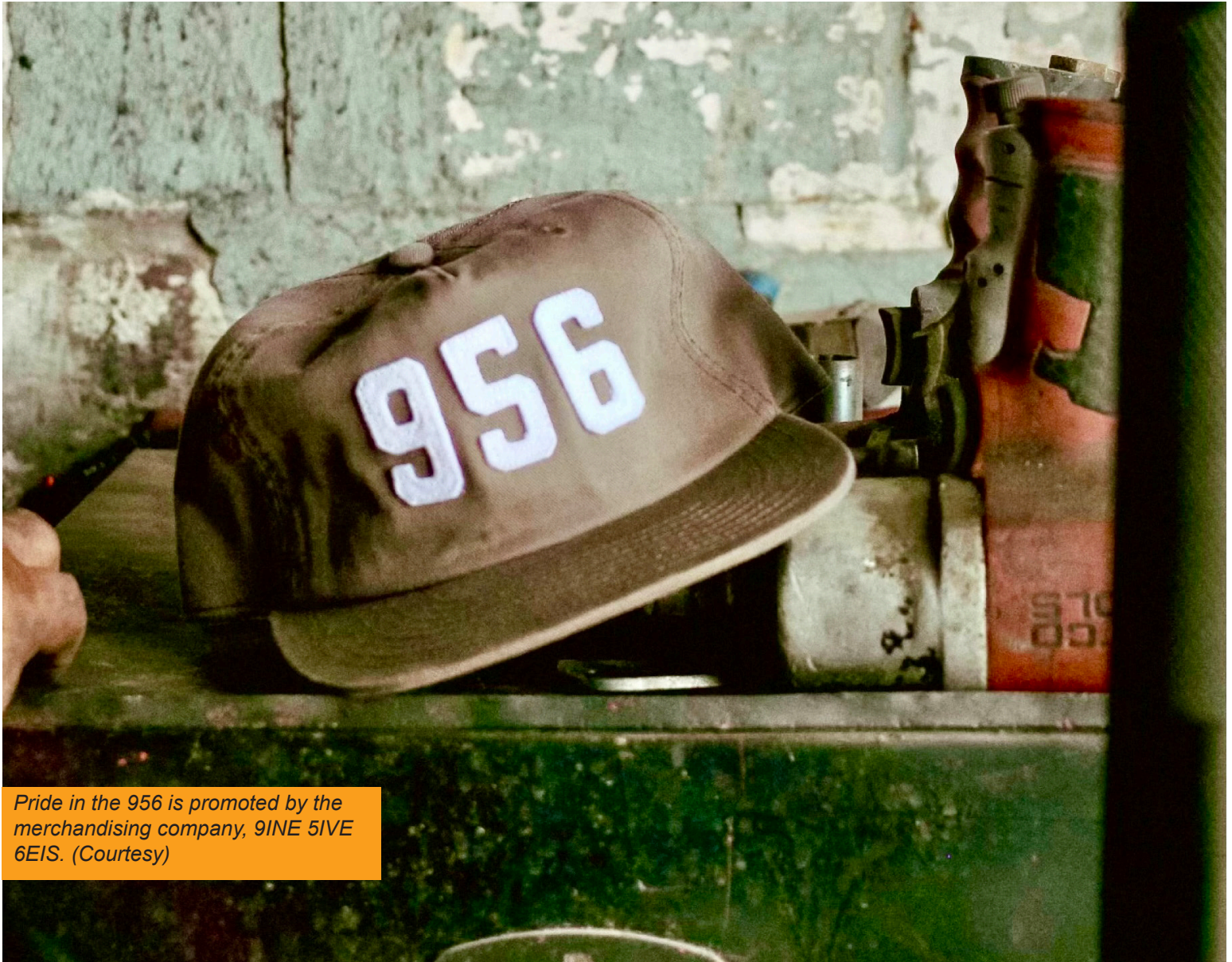
Pride in the 956 is promoted by the merchandising company, 9INE 5IVE 6EIS.

"We've had a real rich history, but that's not the narrative you often hear," he said. "It should be more celebrated. That's part of