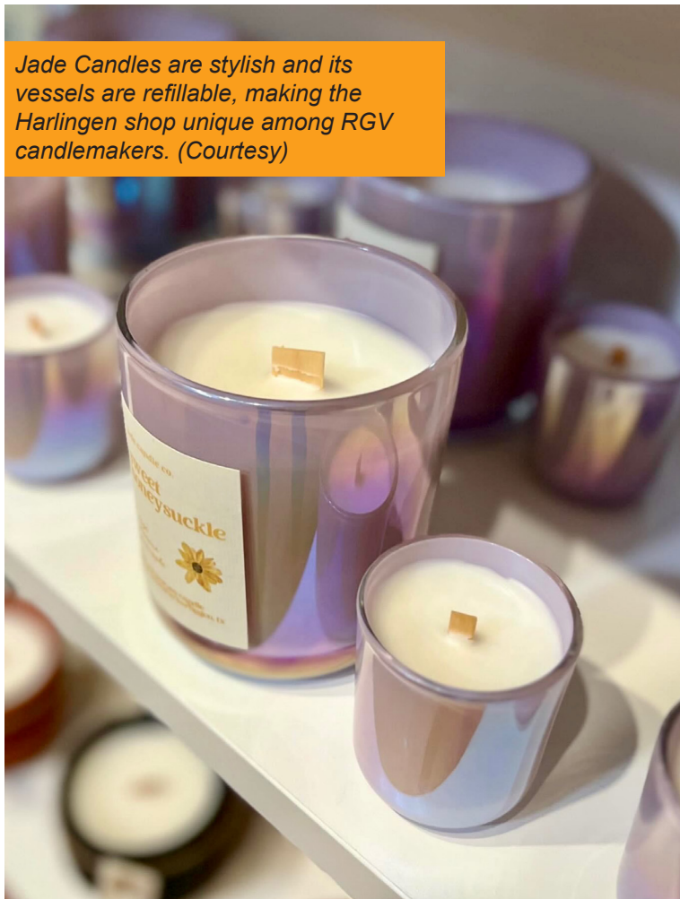
Jade Candles are stylish and its vessels are refillable, making the Harlingen shop unique among RGV candlemakers.